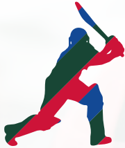
TABLE CRICKET SUPERHERO

We challenge you to build a Table Cricket Superhero who can be a role model to others. Using the I Am A Superhero worksheet, we want you to create a new Superhero. Here's what you need to do: