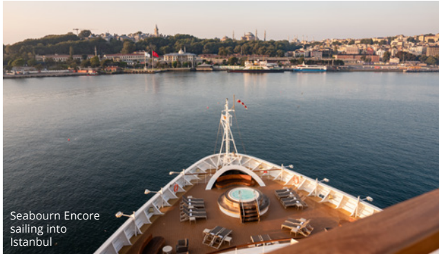
Seabourn Encore sailing into Istanbul