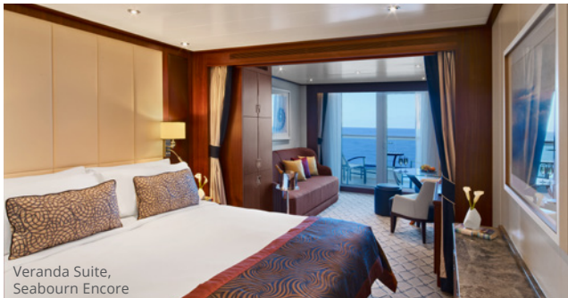
Veranda Suite, Seabourn Encore

Seabourn Encore can slip into picturesque ports and hidden harbours unreachable by larger ships. Yet she features sumptuously furnished living areas, elegant settings for meals created under the guidance of world-renowned chef and restaurateur, Thomas Keller, as well as all spacious ocean-front suite accommodation.