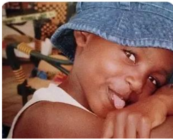
Dina Asher Smith