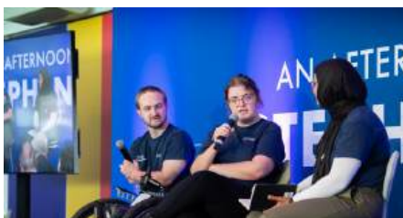
An Afternoon with Stephen Fry, with Youth Ambassadors speaking