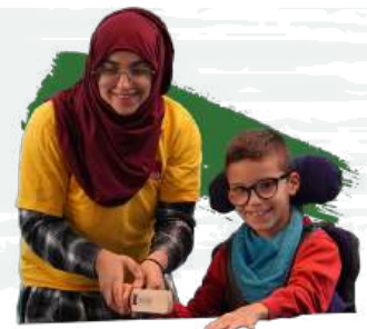
TABLE CRICKET is an adapted version of cricket, played on a table tennis table. The game is inclusive and specially designed to give young people with a disability the chance to play, understand tactics, be part of a team and develop social skills.

WICKETZ is a cricket programme for young people aged 8-19, living in disadvantaged communities. We provide year-round weekly cricket sessions with a focus on breaking down barriers, developing life skills and creating stronger communities.