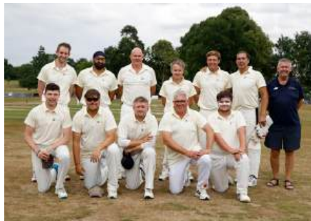
Cricket matches against Bishops Stortford, the MCC at Lord's and the Honourable Artillery Company