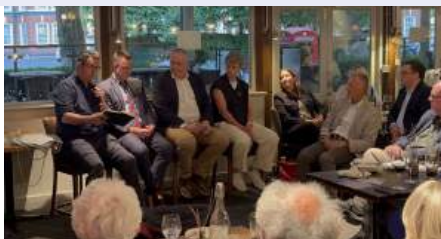
Celebration of our history hosted at the Lord's Tavern after our AGM