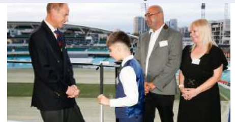
Super 1s Award Evening with HRH Duke of Edinburgh