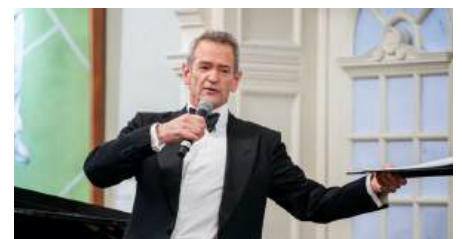
35th annual Long Room Concert with Alexander Armstrong

Thank you to everyone who contributed to our 75th anniversary year, to read more about our history and see more images and impact from 2025, visit t75.lordstaverners.org